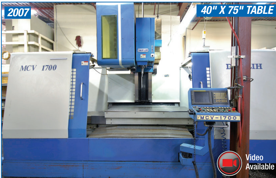
DAHLIH DL-MCV1700 CNC VERTICAL MACHINING CENTER