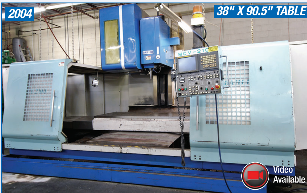
DAHLIH DL-MCV2100 CNC VERTICAL MACHINING CENTER