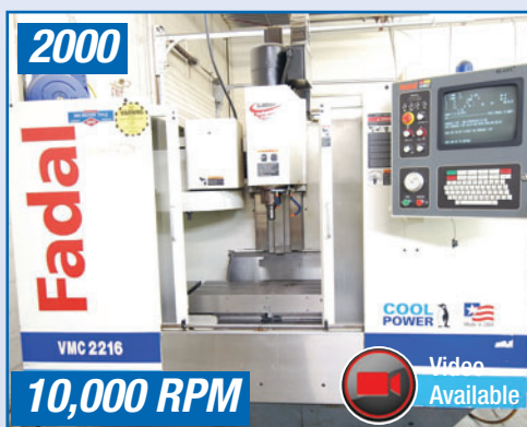
FADAL 904-1 VMC 2216HT CNC VERTICAL MACHINING CENTER