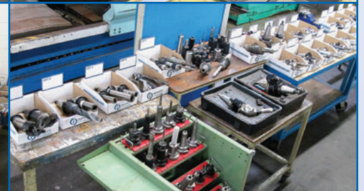
QUANTITY OF HAND AND POWER TOOLS