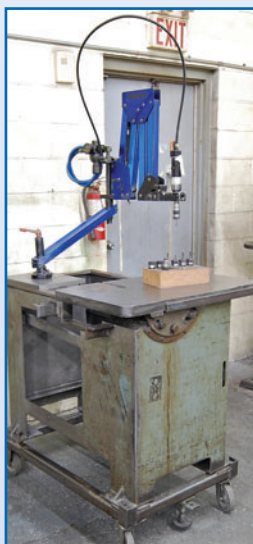
PORTABLE TAPPING MACHINE