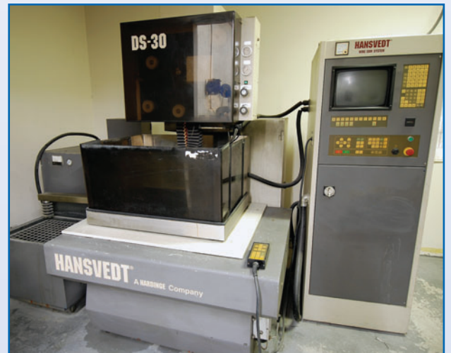
HARDINGE HANSVEDT DS-30 CNC WIRE EDM

Visit infinityassets.com for complete specs and additional photos