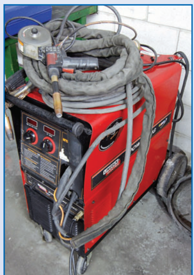
LINCOLN ELECTRIC POWER MIG 255C WELDER