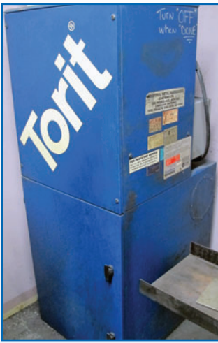
TORIT DUST COLLECTOR