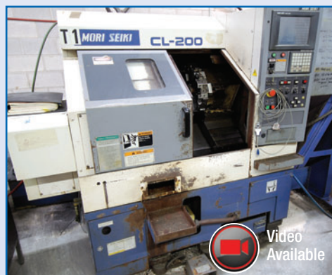
MORI SEIKI CL-200 CNC LATHE