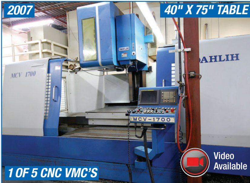
DAHLIHL DL-MCV1700 CNC VERTICAL MACHINING CENTER