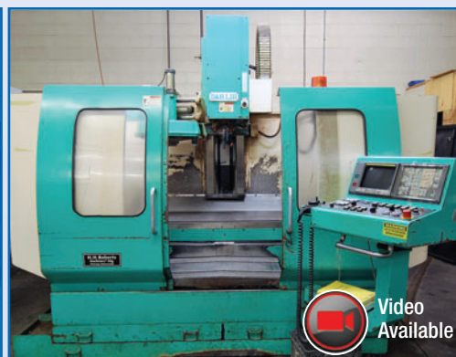
DAHLIH DL-MCV1020B CNC VERTICAL MACHINING CENTER