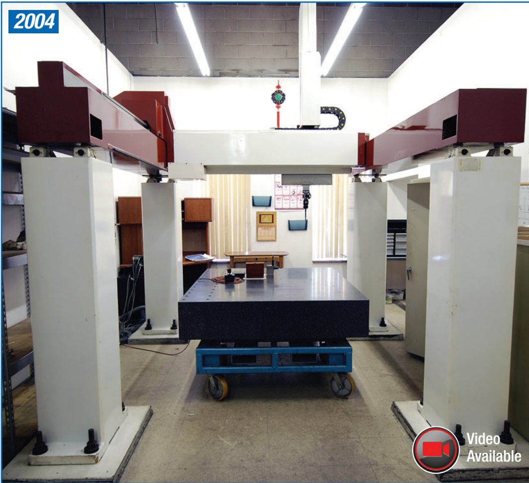
DEA BETA 2304 CMM