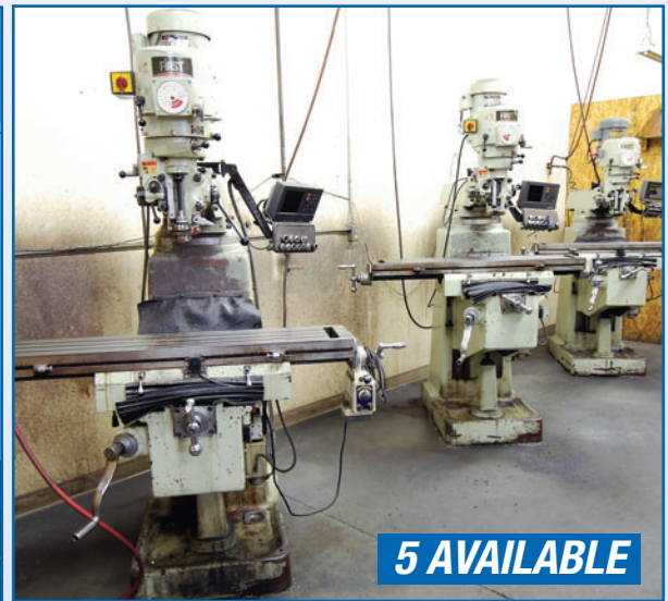
PARTIAL VIEW OF FIRST LC-185VS VERTICAL MILLING MACHINES