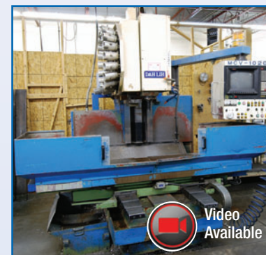
DAHLIH DL-MCV1020 CNC VERTICAL MACHINING CENTER