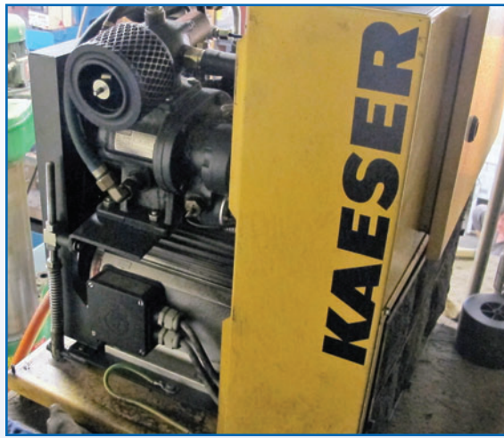
KAESER SIGMA O AIR COMPRESSOR