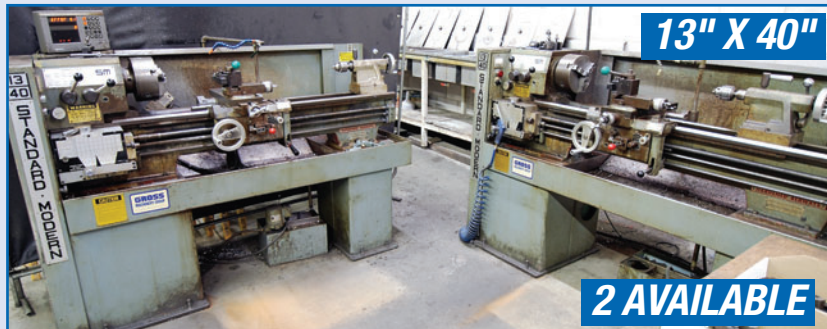
STANDARD MODERN 1340 LATHE