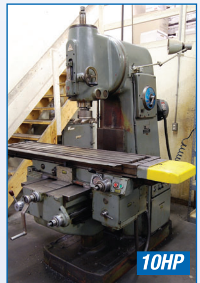
TOS FA4A VERTICAL MILLING MACHINE

(2) STANDARD-MODERN 1340 Lathes, 3 Jaw Chuck, Tailstock, 13" x 40"