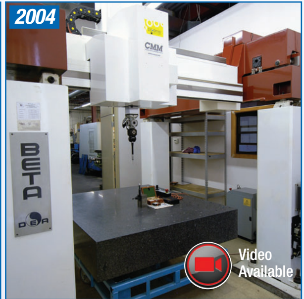
DEA BETA 2304 CMM